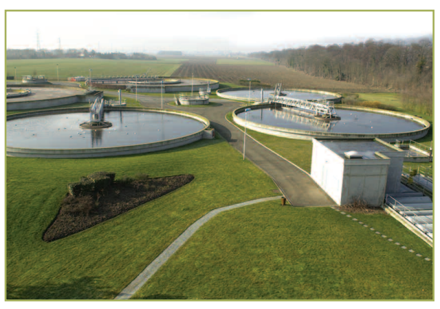
Mureaux wastewater treatment plant - Operated by Degrémont Services